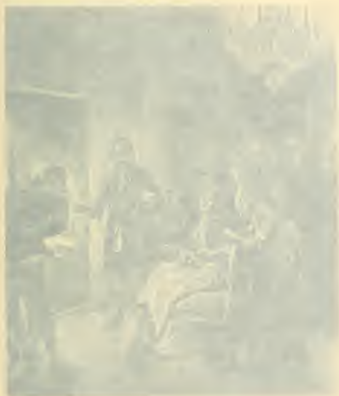
THE GROUP OF PEOPLE SEEN IN THE PHOTO WAS TAKEN BY THE PHOTOGRAPHER AT THE TIME